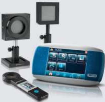
POWER & ENERGY METERS